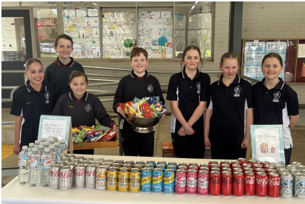
Our fabulous PR Team helping out on Father's and Special Friend's Day