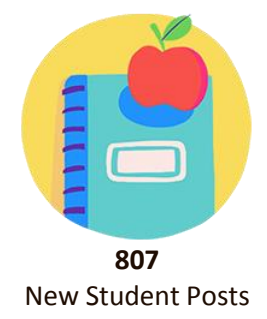
Week of December 1 - December 8 at St Francis Xavier Primary School - Ballarat East